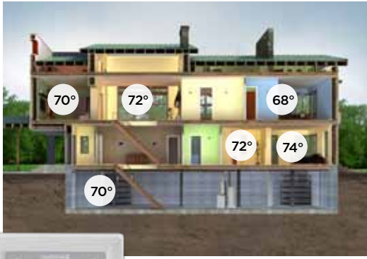
Individual thermostats or zone sensors provide flexibility in temperature management. Control temperatures from the master stat or from separate zone stats.